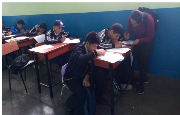
Figure 2: Nursing staff is supporting in carrying out the survey

In Figure 1, the resolution of survey is shown in a classroom of the educational institution at the secondary level by the students, the collaboration of the students can be seen since this allows interaction with them.