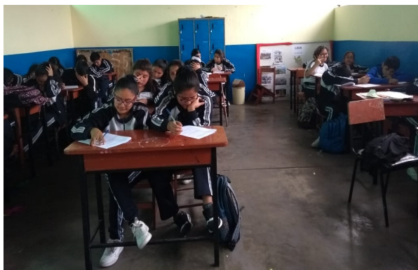
Figure 1: Application of the Survey to the students of the Educational Institution

It is very important to emphasize the presence of classroom teachers at the time of completing the surveys, because this helps students to relay on making questions using the sign of upper hand. In addition to the presence of nursing professionals since the mental health of adolescents is very important, because they are the future where the ways of communication tend to be high and that allow them to generate self-confidence and be able to perform effectively to any situation that is happening.