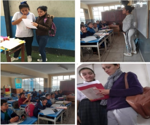
Figure 1: Carrying out the Survey on adolescents in secondary education at the María de los Ángeles Educational Institution N° 3070, in the Puente Piedra district - Lima, 2019.

minutes per classroom, the team surveyed 4 classrooms per day, two days a week, at the time of conducting the surveys, it was quiet since the teachers collaborated so that everything is carried out correctly, as future health personnel, by applying the surveys the team has been allowed to see more closely the means of how they socialize, to know the capacities that some develop in their environment, among the needs, etc. The team also make sure that the filling and process is correct and detect in a timely manner some erroneous process that may have been presented.