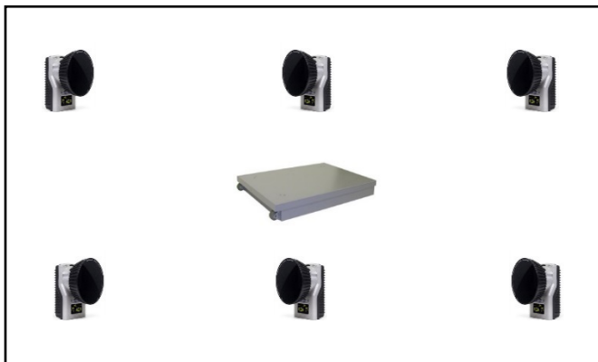
Figure 2: The field set-up of infrared cameras relative to the force platform