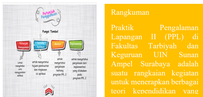
Figure 4: Application Guidelines And An Application Summary

To ease the user in operating the application, guidance and summary result were provided thoroughly as it is seen in Figure 4.