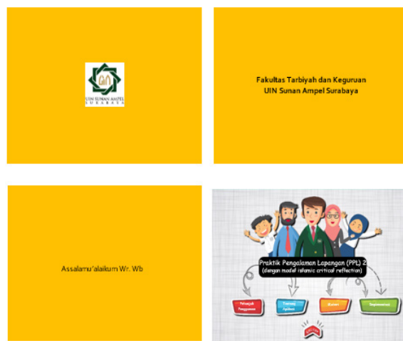
Figure 3: Preliminary Display of the Pre Service Teacher Interference Model Application through the Islamic Critical Reflection Approach

The 3-2-1 approach is also supported by the pyramid theory of human needs from Malow [15]. Humans in their lives have different needs, those needs from the high to the low. The lowest needs are the need to acknowledge oneself, then the need for compassion, love and love, then the need for security, and the highest needs are physiological needs. The higher the education of a person the higher the level of recognition desired [16]