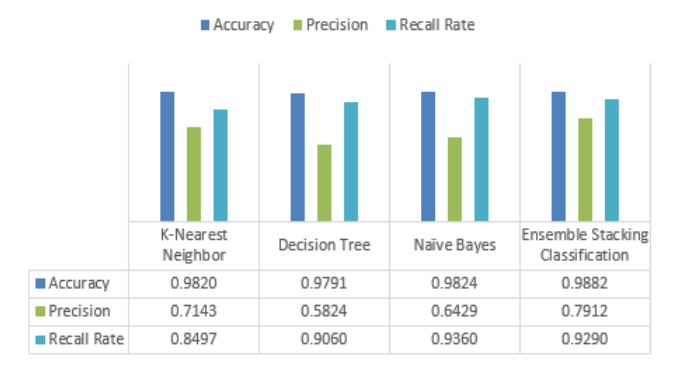
Figure 3: Comparison performance prediction between models