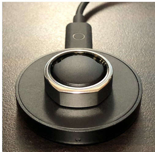
Figure 2: State of charging

Pulse wave measurement uses an LED light sensor. Infrared and red LED run in dark places because they are more affected by ambient light, and green LED runs in bright places because they are less affected by ambient light. These sensors measure the amount of blood flow (change in blood vessel volume) that