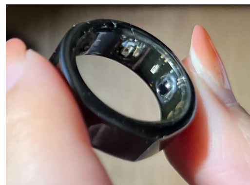
Figure 1: Oura Ring Generation 3

The ring-type wearable sensor used Oura Ring Generation 3 (Oura, Inc., USA). Oura Ring has 15 sensors inside a titanium ring and can measure biological information such as heart rate, skin temperature, physical activity, and sleep index.