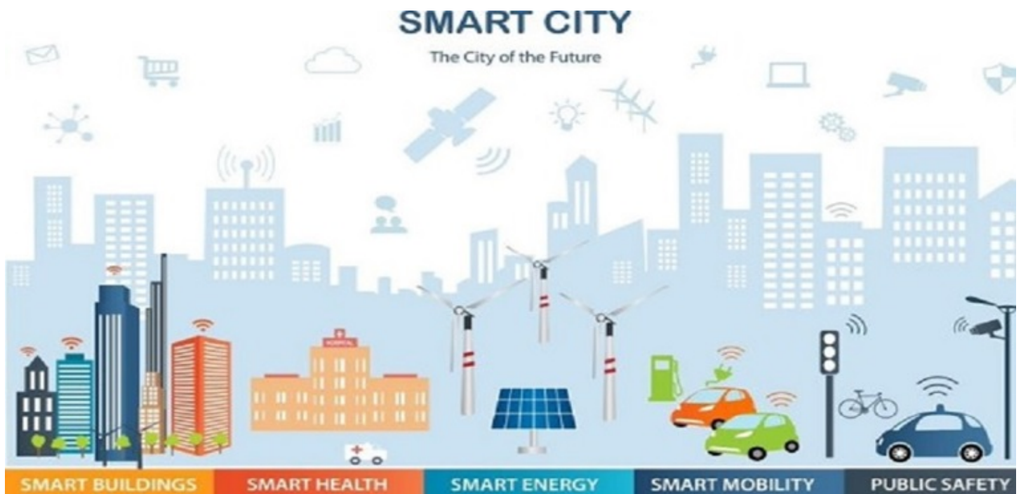
Figure 1: Illustration of services of a typical smart city [13]

Urbanization has been boosting economic growth, but it has also exposed many cities to housing, infrastructure and service challenges to meet the demand of a growing population. With more and more challenges, the application of new technologies to solve the problems is becoming more and more popular. To solve such problems, cities are required to be smarter. Therefore, smart cities will be a popular trend of many countries around the world. They will bring high quality living standards for everyone with a focus on several key aspects such as smarter environment, smarter mobility, smarter connectivity and smarter management.