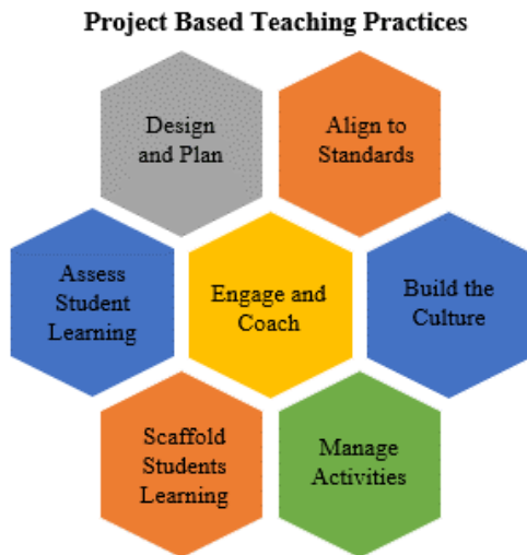
Figure 1: Key Knowledge, understanding and success skills enhanced by Gold Standard PBL; source: [18]

The project-based learning (PBL) might be one of the methods suitable for teaching this new generation of digitally native students. The Gold Standard of project-based learning (Figure 1) introduced by [18] includes also other skills such as self-reflection, critical thinking, research and inquiry skills.