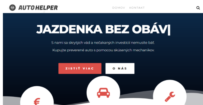
Figure 2: Final web-site of the service supporting sale of used cars; source: own based on students' web-site

The first course named “Marketing tools for the presentation and evaluation of business ideas” aims to concede practical education in the area of first steps in the entrepreneurial life cycle, for example, the introduction of new idea or product, and afterward company/corporate marketing. Within this course, students solve the practical problems of developing the product, fitting the product for the market, promotion, and analytics. This allows students to experience the start of the company from scratch widely supported by various ICT tools [1].