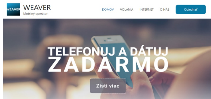
Figure 3: Final web-site of the service supporting the free call of a new service provider

Google Trends, Google Tag Manager, Google Market Finder, WordPress, and others. To achieve the final goal, i.e. to make a decision about the competitiveness and sustainability of their product or service, students need to design a web page, which is used for collecting main data for the Google Analytics tool. Figure 2 and Figure 3 represents the preview of designed websites.